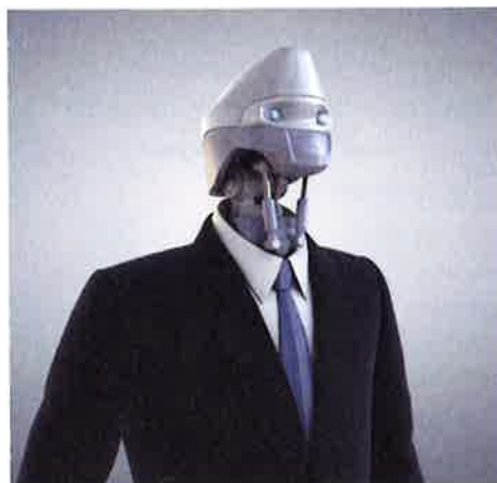
Robots may fill nearly half of Japan's jobs in 10–20 years.

The workers most likely to be replaced by robots are taxi drivers, clerical staff, security guards and receptionists.